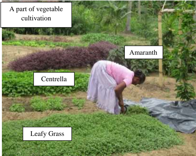
A part of vegetable cultivation