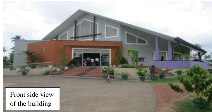
Front side view of the building