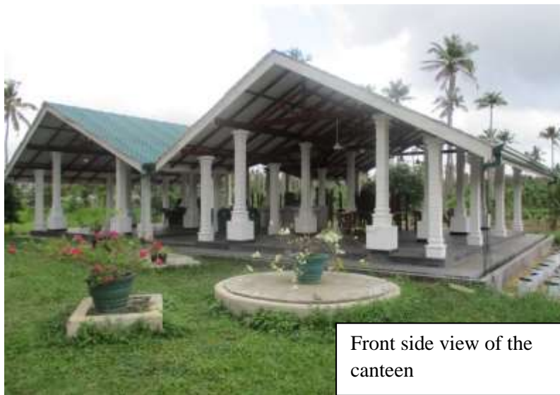
Front side view of the canteen