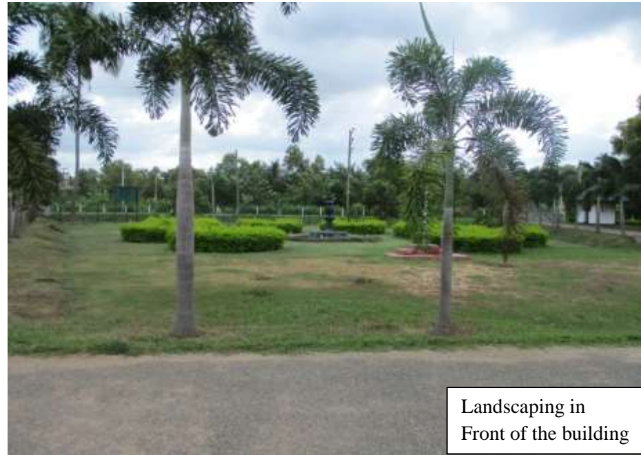
Landscaping in front of the building