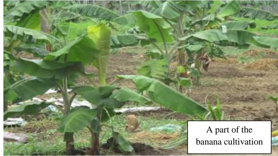
A part of the banana cultivation