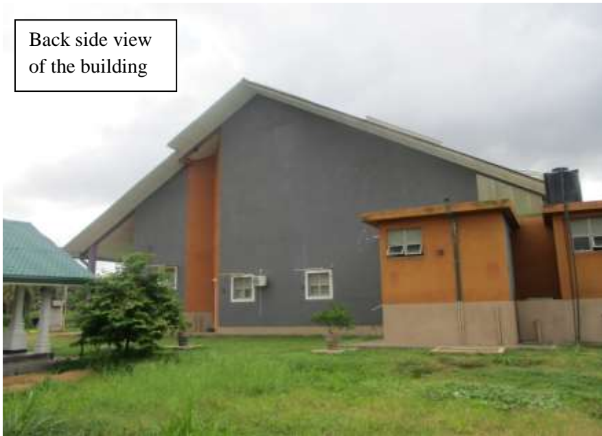
Back side view of the building